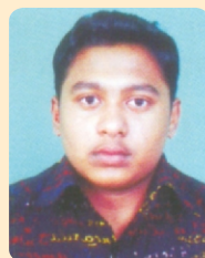
Hathim 92 / 200