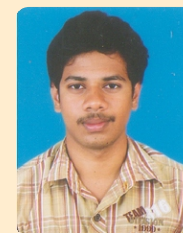
Amarnath 100 / 200