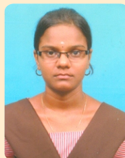
Malini 113 / 200