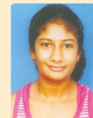
Ovia 108 / 200