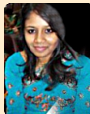
Oshin 114 / 200