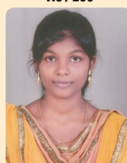
Devaarul 103 / 200