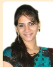
Nowshiba 104 / 200