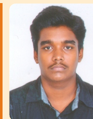
Murugan 123 / 200