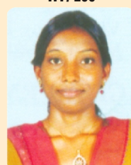
Puvizhi 102 / 200