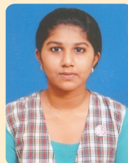
Haritha 106 / 200